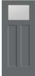
DOOR | FRONT UFP Therma Tru Slabs Color