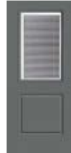
DOOR BACK UFP Therma Tru Slabs Color